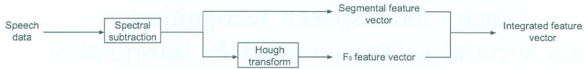
Fig. 1. A flow chart of the proposed method.

First, speech waveforms were sampled at 16 kHz and transformed to 256 dimensional cepstrum. Then, a 32 ms-long Hamming window was used to extract frames every 10 ms. Since the peak value tends to be large in a low-dimensional cepstrum under noise, the following weight factor k_d was multiplied to the cepstrum coefficients of d -th dimensional in the low dimension (30-140 dimension) to reduce its effect: