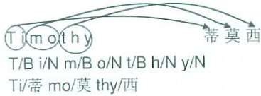
Figure 3: An example of the CRF segmenter format and E2C converter

defined as f_k(l_t, l_{t-1}, C, t) (Eq. 2). f_k is usually a binary function, and takes the value 1 when both observation c_t and transition l_{t-1} \rightarrow l_t are observed. In our segmentation tool, we use the following features