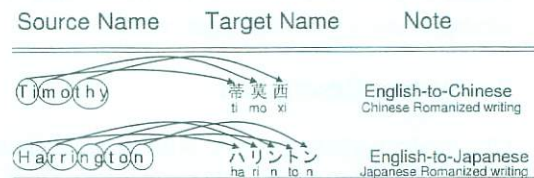
Figure 1: Transliteration examples

For example, in Japanese, foreign words imported from other languages are usually written