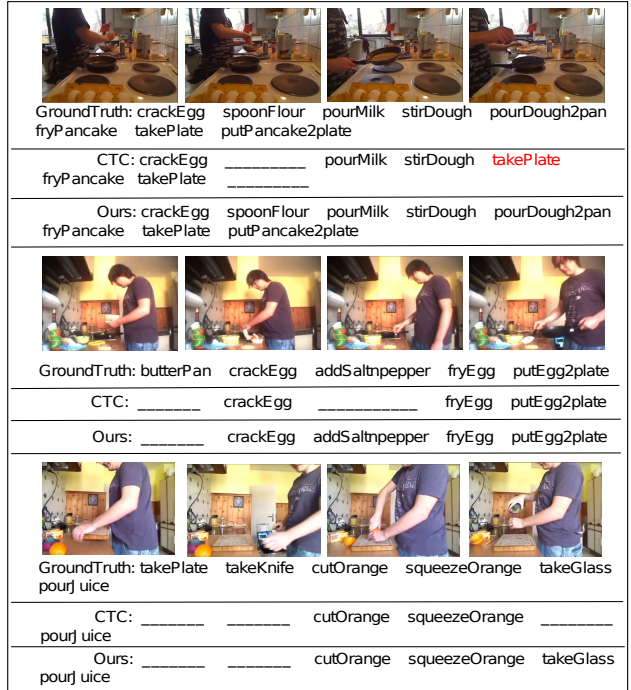
Fig. 2: Qualitative results on Breakfast dataset. Our method (CTC+Trigram+Len) is compared with the CTC baseline. The underscores denote deletion error and the red color on the action labels denotes substitution error.

We also investigated the effect of the LM term in Eq. (14), by excluding the length term . Row 3 to Row 5 in Table 1 show the results when the LM term was given by a bigram, trigram and quadgram respectively. One can see that by incorporating a statistical language model it helped to boost the performance significantly. Among them, the tri-