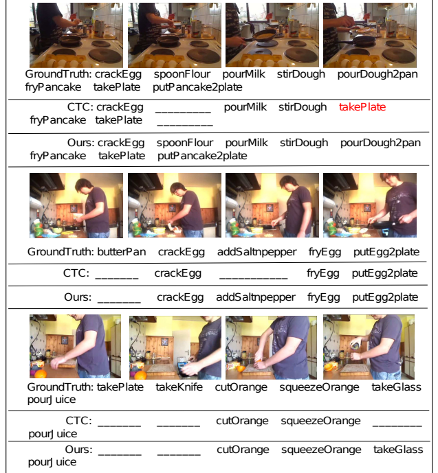
Fig. 2: Qualitative results on Breakfast dataset. Our method (CTC+Trigram+Len) is compared with the CTC baseline. The underscores denote deletion error and the red color on the action labels denotes substitution error.

We also investigated the effect of the LM term in Eq. (14), by excluding the length term . Row 3 to Row 5 in Table 1 show the results when the LM term was given by a bigram, trigram and quadgram respectively. One can see that by incorporating a statistical language model it helped to boost the performance significantly. Among them, the tri-